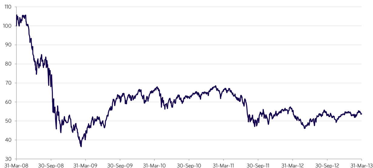
Chart 1. STOXX Europe Select Dividend 30 Price Index (rebased at 100) between March 31, 2008 and March 31, 2013

As the left part (i.e. March 2008 – March 2009) of Chart 1 demonstrates, when there is turmoil in the markets there is no shelter for investors to hide from the storm. Correlations increase - across major asset classes - and volatility spikes up. Whilst there is an array of different financial instruments (and each of them comes with their pros and cons) that investors could employ as volatility insurance policies, the reality is that investor portfolios have traditionally suffered a lot on the back of sudden and prolonged volatility bursts and heightened risk levels.