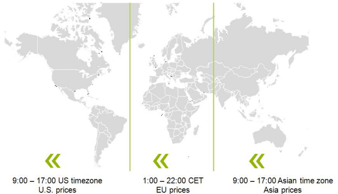
Figure 1: Global underlying pricing coverage